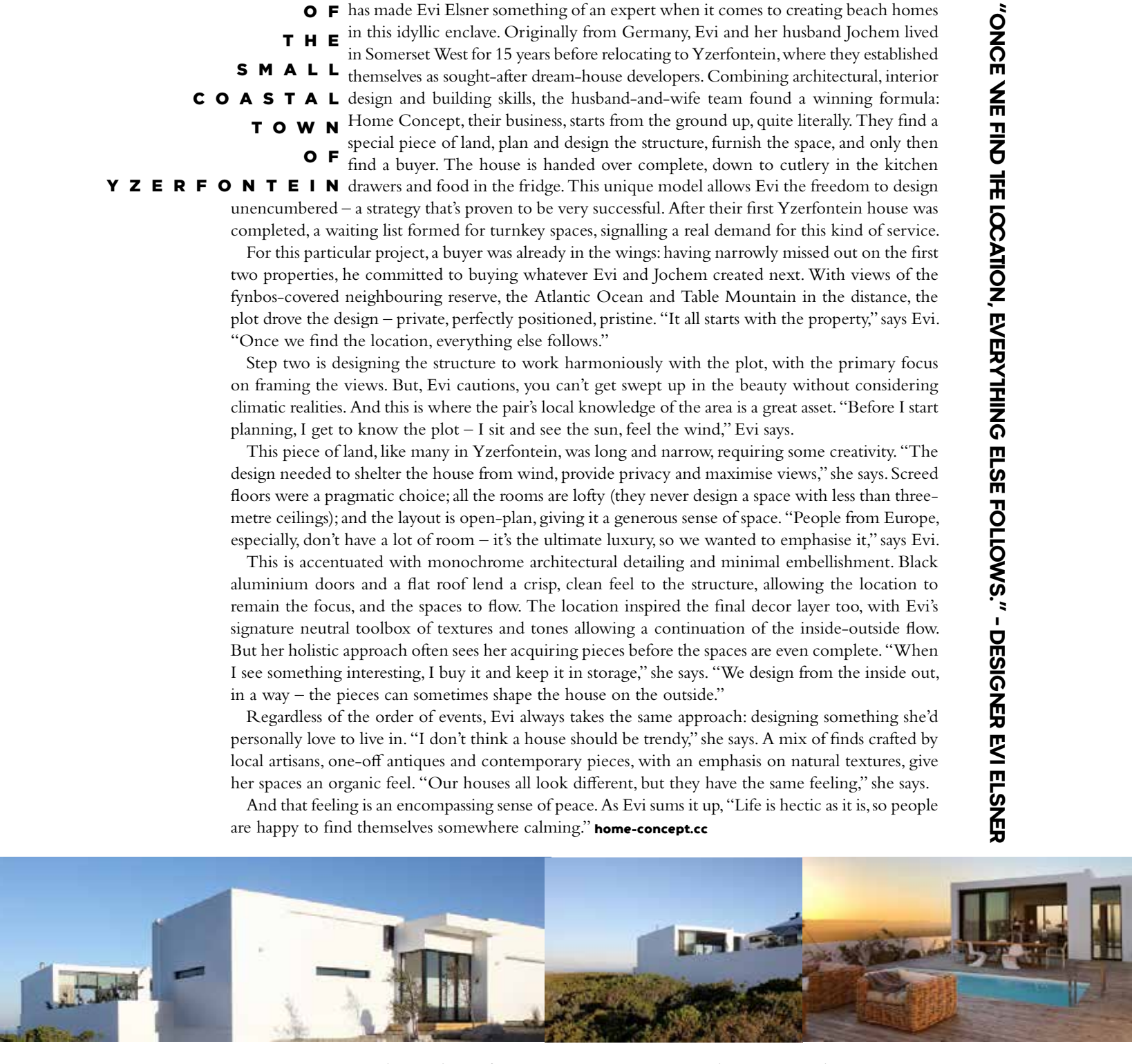
ABOVE, FROM LEFT Designer Evi Elsner's monochrome palette was applied to the exterior as well as the decor for a crisp, clean effect; the long, narrow site dictated the layout of the house; inside/outside flow allows for maximum enjoyment of the unparalleled position. OPPOSITE, FROM TOP In-depth knowledge of the location allowed Evi to plan for the best possible sun, wind and view orientation; the pared-back vision for the house was, in part, to allow the setting to remain the primary focus.